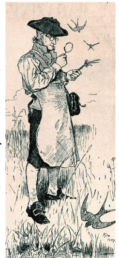
John Bartram by Howard Pyle